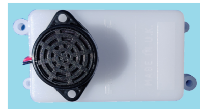
Kit Components (Cables not shown)