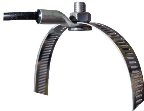
Type 'B' External

This sensor is intended for engine block temperature monitoring although it can equally be used for exhaust temperature.