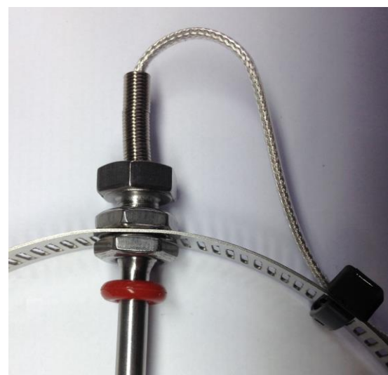
Type 'A' (in-Hose)

Use a cable tie to secure the cable to the hose clamp as shown.